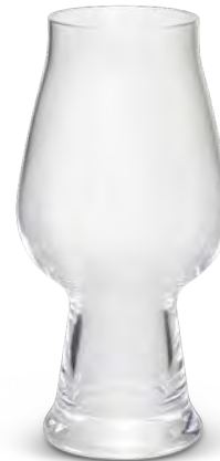
Luigi Bormioli Birratique Beer Glass 120633