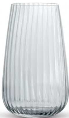
Luigi Bormioli Optica Hi Ball 123295